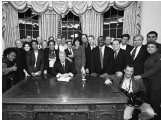
Celebrating with my staff after my final address to the nation