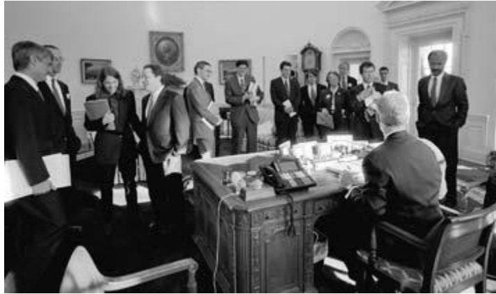
With the economic team in the Oval Office

Briefing in Shepherdstown, West Virginia, with my Middle East team: Madeleine Albright, Dennis Ross, Martin Indyk, Rob Malley, Bruce Reidel, and Sandy Berger. Deputy Chief of Staff Maria Echaveste is at far right.