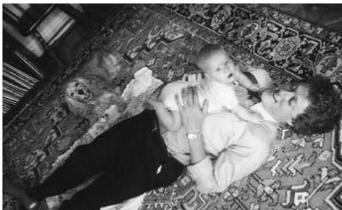
With Chelsea and Zeke