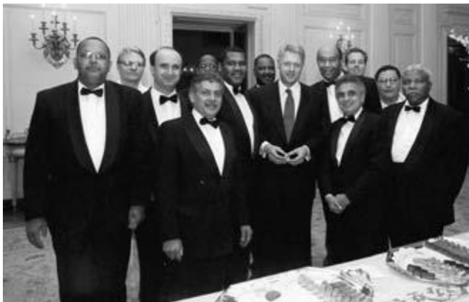
With the White House residence butlers and staff