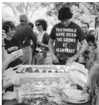
Celebrating my thirty-second birthday during the campaign. Hillary is in dark glasses.