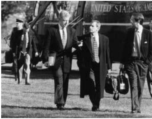
Arriving on Marine One, with Bruce Lindsey and Erskine Bowles