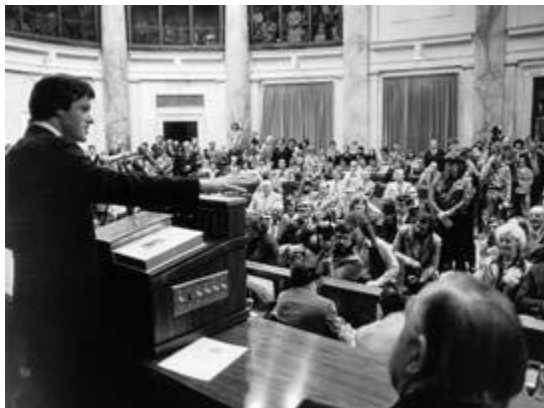
Addressing the Arkansas legislature after I was sworn in as governor, January 9, 1979