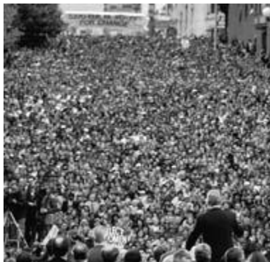
Rally in Seattle