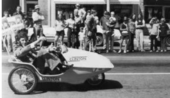
Campaigning for Congress, 1974