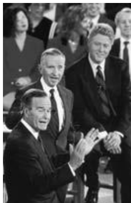
President George H. W. Bush, Ross Perot, and I at the University of Richmond debate