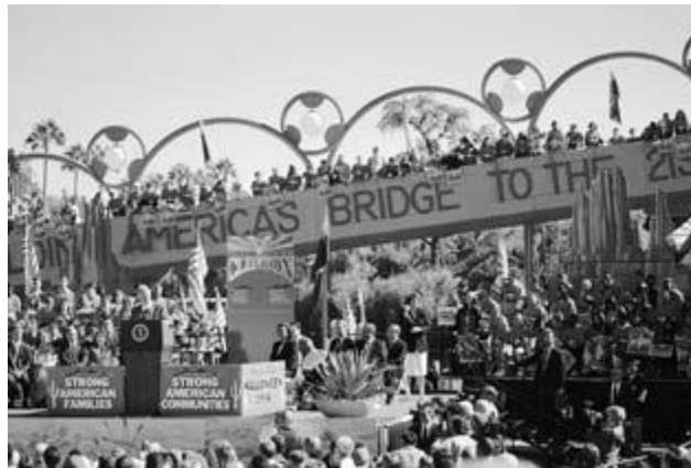
Speaking about America's bridge to the twenty-first century at Arizona State University