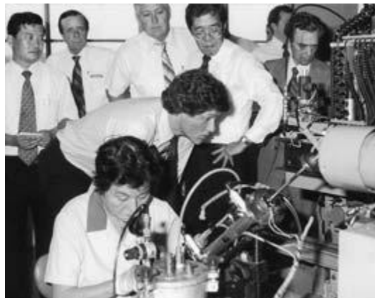
At the Sanyo Electric plant in Japan