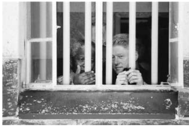
South African president Nelson Mandela and I in the cell on Robben Island, where he had spent the first eighteen of his twenty-seven years in captivity