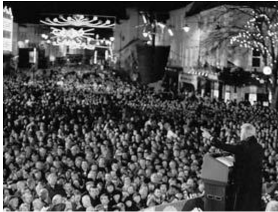
Addressing a crowd in Market Square, Dundalk, Northern Ireland