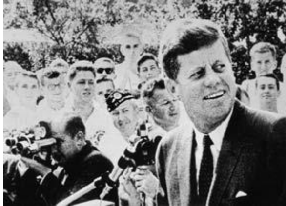
I'm in the front, right behind the photographer, as President John F. Kennedy addresses the Boys Nation delegates in the Rose Garden on July 24, 1963.