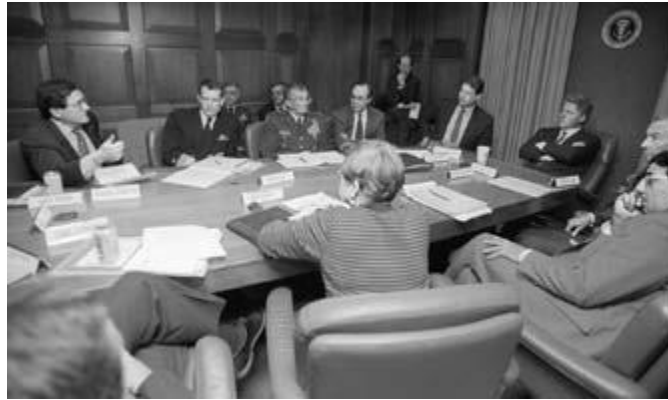
Bosnia briefing in the White House Situation Room