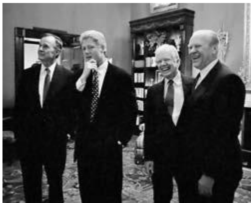
In the residence private study, with Presidents George Bush, Jimmy Carter, and Gerald Ford on the eve of the announcement of the campaign for NAFTA