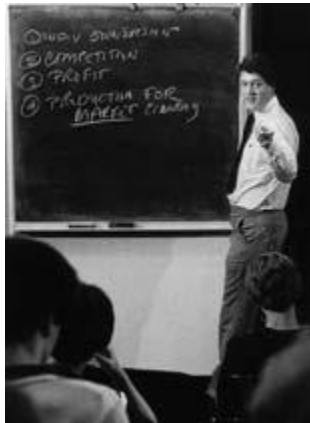
Teaching at the University of Arkansas Law School, Fayetteville