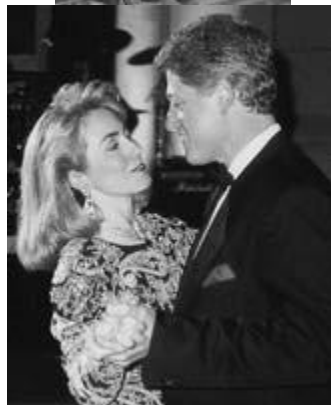
Dancing with Chelsea and with Hillary at the Governor's Inaugural Ball, January, 1991