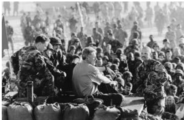
Visiting with the troops in Kuwait