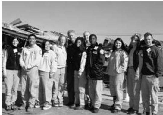
With AmeriCorps volunteers at a tornado site in Arkansas