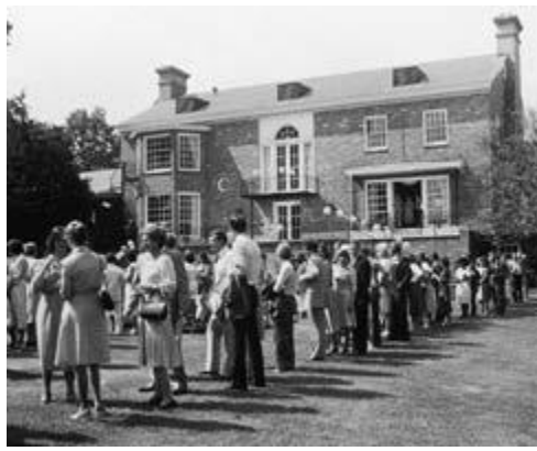
Parents and students at the Governor's Mansion for High School Honors Day, celebrating the valedictorians and salutatorians of Arkansas high schools