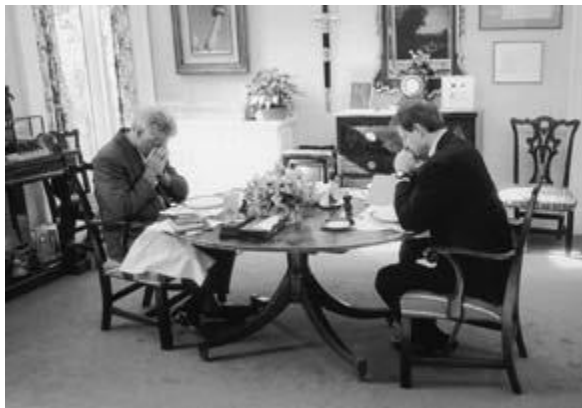
Al and I praying at our weekly lunch