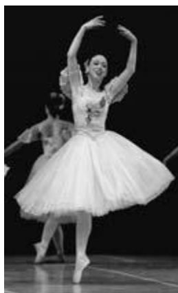
Chelsea in The Nutcracker