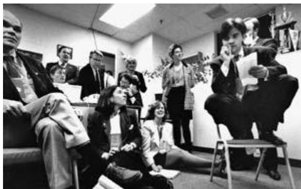
The campaign team