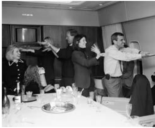
Celebrating our 1996 victory aboard Air Force One