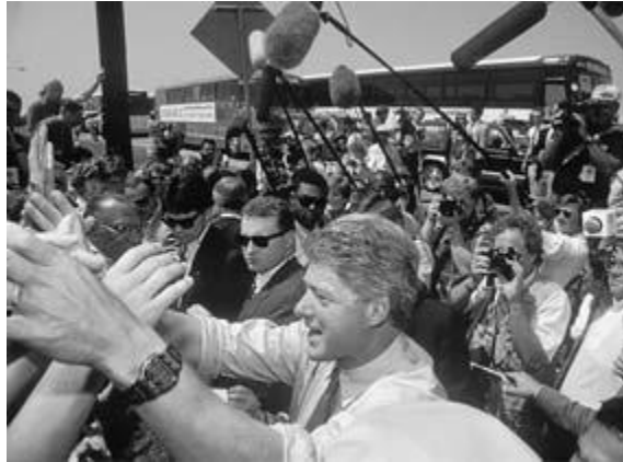
The bus tour