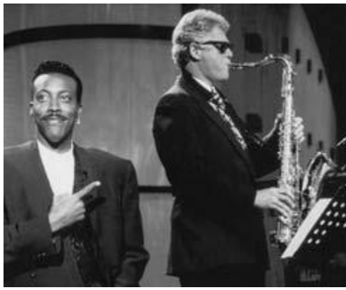
The Arsenio Hall Show