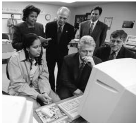
Bringing the Internet into America's classrooms, with Dick Riley