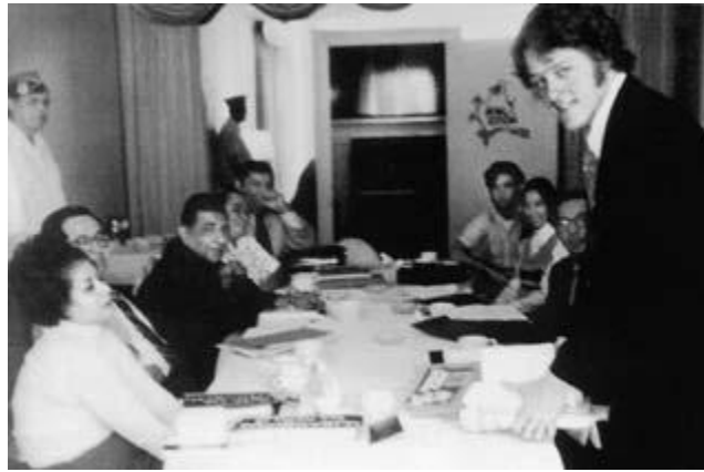
Campaigning for George McGovern in San Antonio, Texas, 1972

Hillary and I with our Yale Law School Barristers Union classmates