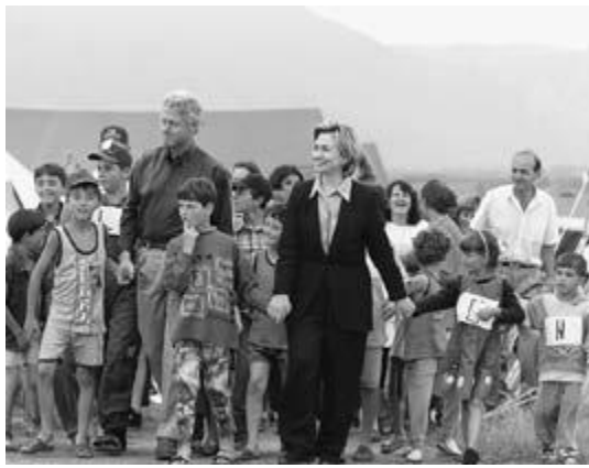
Hillary and I touring a Kosovar refugee camp in Macedonia