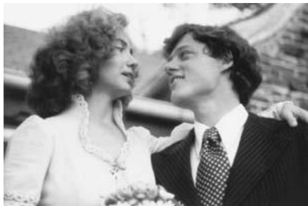
Our wedding day, October 11, 1975