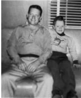
Daddy and I at home in Hope, 1951