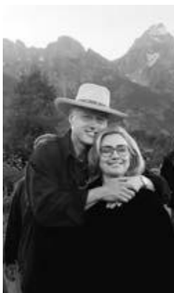
With Hillary in Wyoming