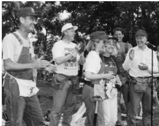
Hillary and I, Tipper and Al Gore, President Jimmy Carter, and (at left) Habitat for Humanity founder Millard Fuller celebrate Tipper's and my joint birthday.