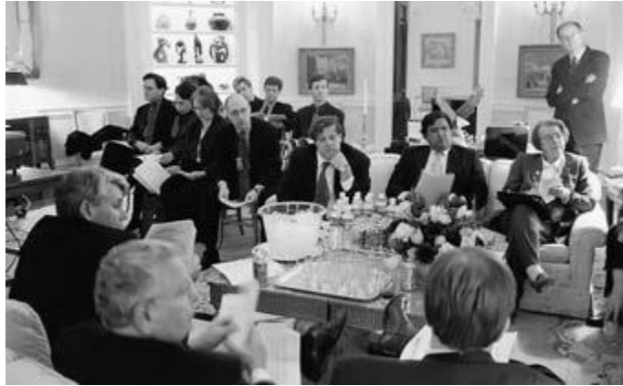
A strategy meeting in the Yellow Oval Room