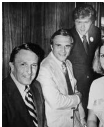
Campaigning with my gubernatorial predecessors Dale Bumpers and David Pryor