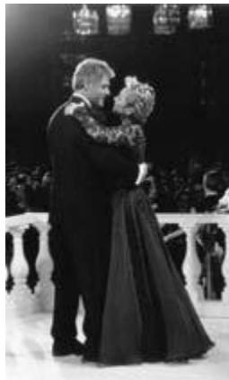
The inauguration and an inaugural ball, January 20, 1993