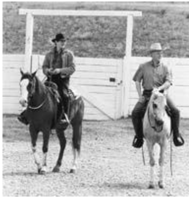
Riding with Harold Ickes in Montana