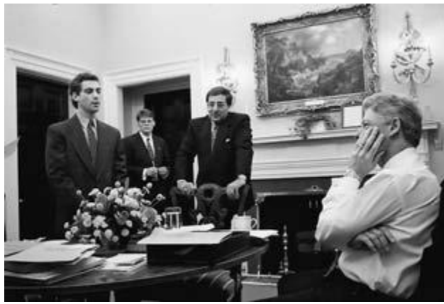
Rahm Emanuel and Leon Panetta brief me in the Oval Office dining room.