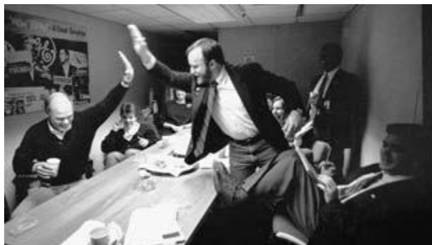
In the “war room” James Carville and Paul Begala high five