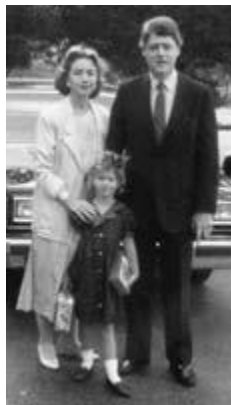
Chelsea's first day of school.