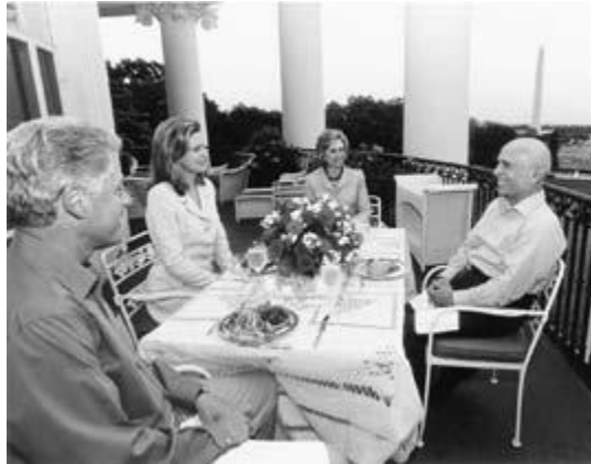
Our friends Queen Noor and King Hussein join Hillary and me on the Truman Balcony.