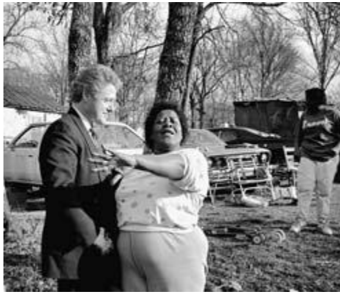
Campaigning in Stone Mountain, Georgia