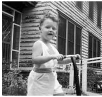
in our backyard;