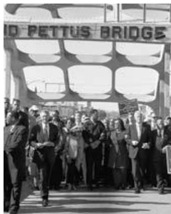
Commemorating the thirty-fifth anniversary of the voting rights march in Selma, Alabama, by crossing the Edmund Pettus Bridge with Jesse Jackson, Coretta Scott