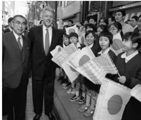
With Japanese prime minister Keizo Obuchi in Tokyo