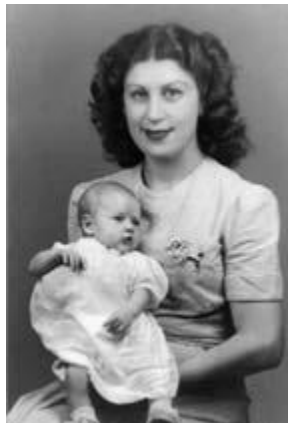
Mother and I