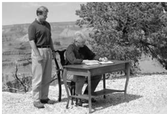
Al and I on the edge of the Grand Canyon establishing the Grand Staircase–Escalante National Monument