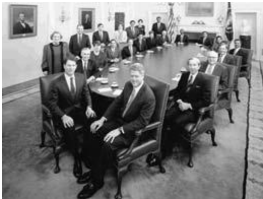
Al Gore and I with the cabinet: (standing, from left) Madeleine Albright, Mack McLarty, Mickey Kantor, Laura Tyson, Leon Panetta, Carol Browner, Lee Brown; (seated, from bottom left) Lloyd Bentsen, Janet Reno, Mike Espy, Robert Reich, Henry Cisneros, Hazel O'Leary, Richard Riley, Jesse Brown, Federico Peña, Donna Shalala, Ron Brown, Bruce Babbitt, Les Aspin, and Warren Christopher