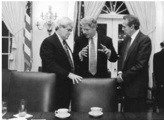
With Republican leaders Representative Newt Gingrich and Senator Bob Dole in the Cabinet Room