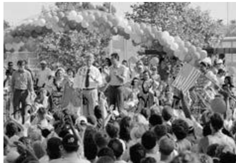
Cinco de Mayo