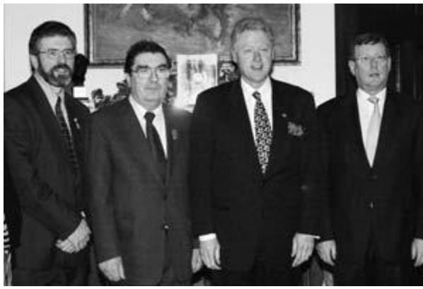
With Gerry Adams, John Hume, and David Trimble on St. Patrick's Day 2000