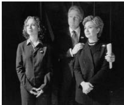
February 7, 2000: Hillary announces her campaign for the Senate