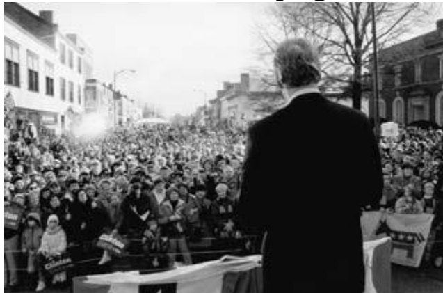
Tipper Gore took this picture of the huge crowd in Keene, New Hampshire