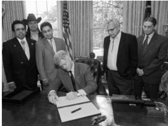
Signing an executive order with representatives of Native American Tribal Governments