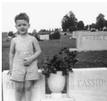
Here I am in 1949. At my father's gravesite on the afternoon Mother left for nurse's training in New Orleans;