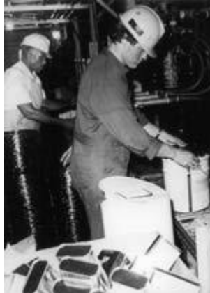
My workday at the Tosco plant