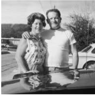
Mother and Daddy, 1965