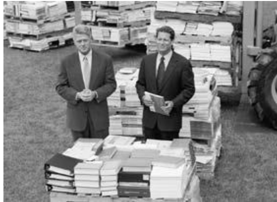
Al and I, on the South Lawn, announcing the elimination of forklifts of government regulations, part of our Reinventing Government initiative