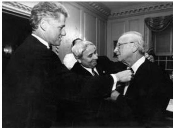
Straightening Prime Minister Yitzhak Rabin's tie. It would be our last time together.