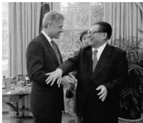
With Chinese president Jiang Zemin in the Oval Office