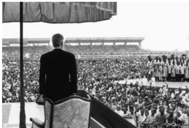
Addressing a crowd of more than 500,000 in Independence Square, Ghana