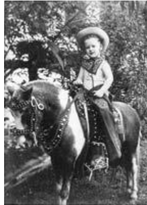
posing for a photo for Mother's Day