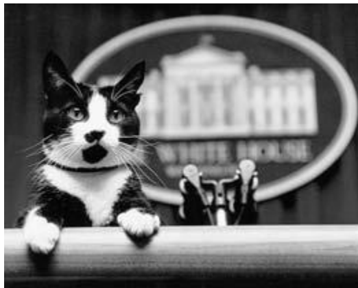
Socks briefing the press