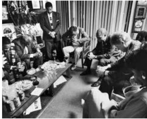
At a prayer meeting after the Los Angeles riots