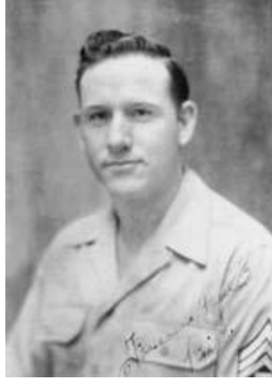
My father, William Jefferson Blythe, 1944