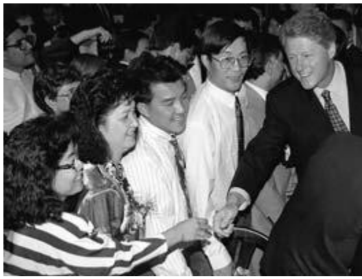
Greeting supporters in Los Angeles