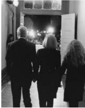
Election night, November 3, 1992